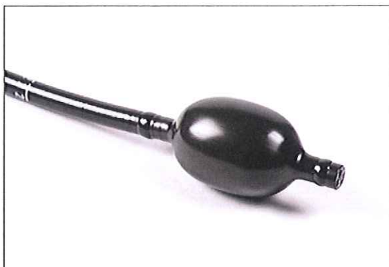
Fig. 1: NaviAid™ G-EYE™ endoscope

Aim of the current work was to determine the safety as well as the efficiency of the new available (gained CE-mark, pending FDA clearance) colonoscope.